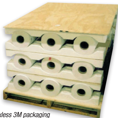
Boxless 3M packaging

The 3M Graphics Market Center is working to develop environmentally preferred packaging by focusing on these three initiatives.