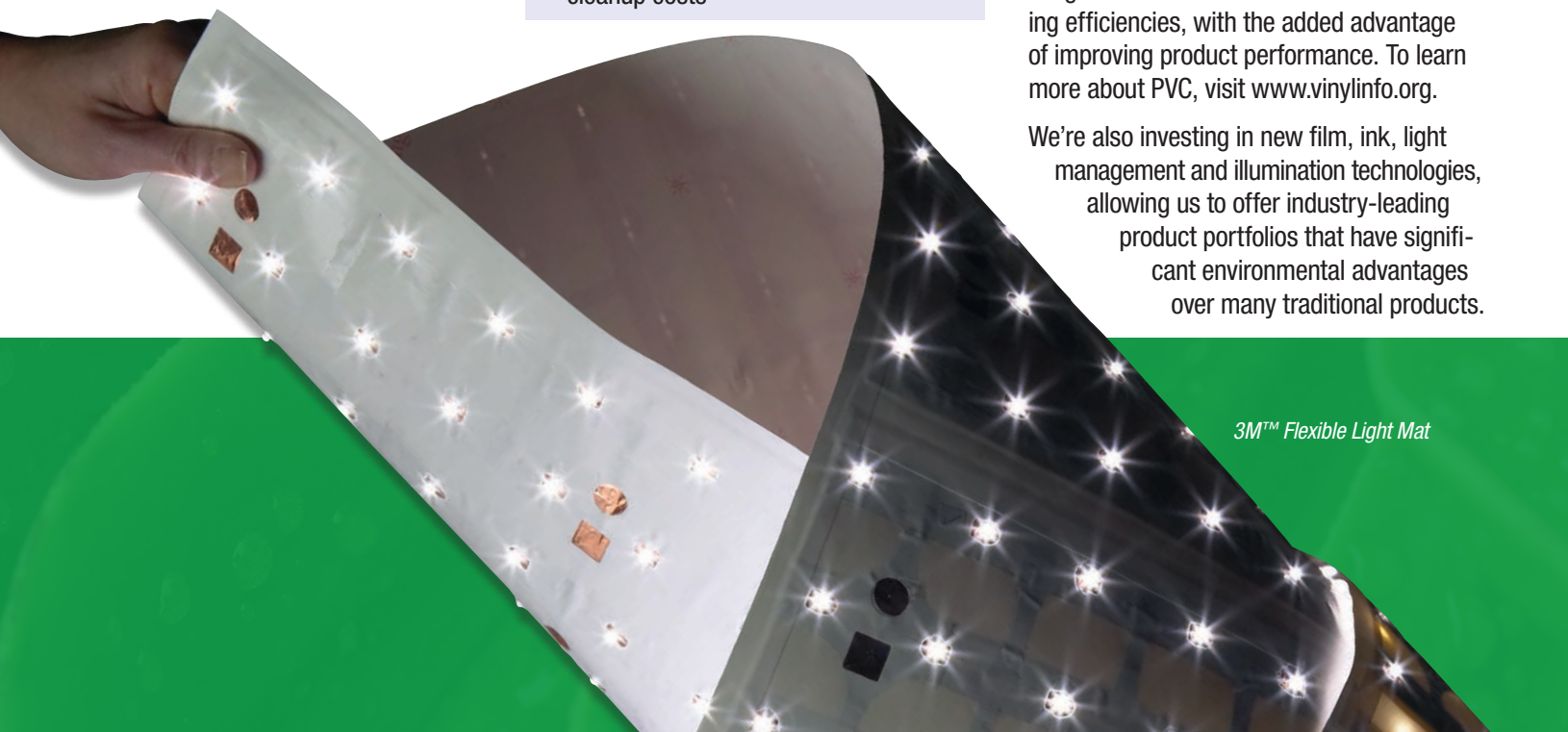
3M™ Flexible Light Mat

We're also investing in new film, ink, light management and illumination technologies, allowing us to offer industry-leading product portfolios that have significant environmental advantages over many traditional products.