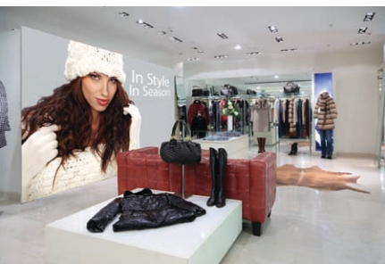
3M™ Wall Decorating Film IJ86E